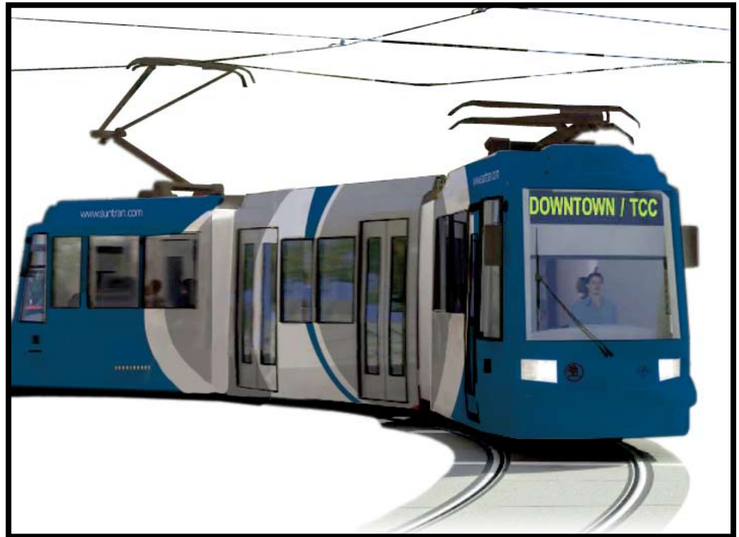
Construction of the streetcar rail is expected to begin early in 2012.

Stay tuned on project updates at www.TucsonStreetcar.com .