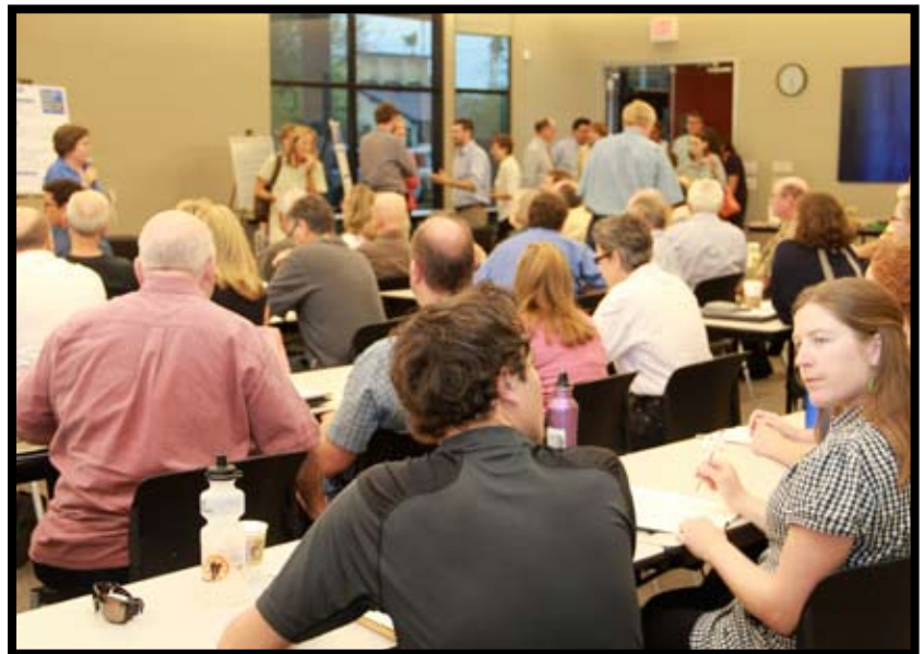
A fall meeting introducing a regional water report drew a full house in the conference room at Tucson Association of Realtors.

The report is posted on PAG's website at www.PAGregion.com .