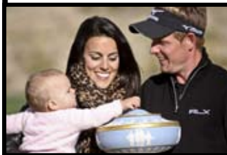
Luke Donald, last year's winner, is shown with his family.

The event comes to the Ritz-Carlton, Dove Mountain, Feb. 20-26. This is the fourth year the tournament is being held at the resort. Before that, the tournament was played at The Gallery Golf Club in Marana.