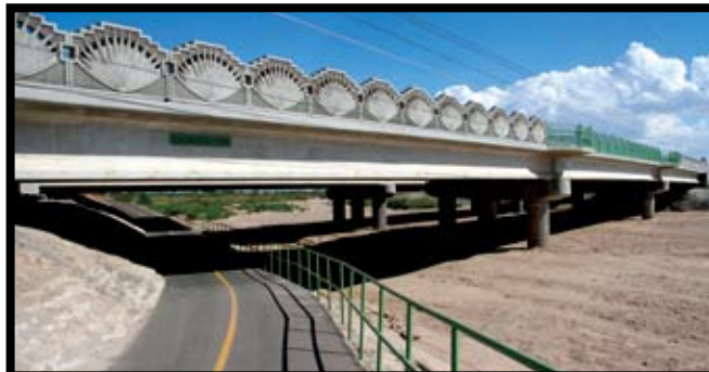
La Cholla Blvd., new Rillito River bridge, bike lanes/sidewalks

La Cholla Boulevard, Ruthrauff to River Road , was dedicated Sept. 9. The project, managed by Pima County Department of Transportation, included widening to six lanes, a new bridge at the Rillito River, bike lanes and sidewalks. Other features include new storm drains along the roadway and to the Rillito River, curbs, bus pullouts, landscaping, public art by Vicky Scurri, and sidewalks that connect to the Rillito River Park Path. This project also included intersection improvements at Curtis Road and Ruthrauff Road.