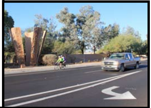
Tanque Verde Road

widening to four lanes, bike lanes and sidewalks, raised medians, storm drains, paved shoulders, landscaping and public art by Thomas Sayre.