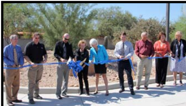
La Cañada Drive ribbon cutting

La Cañada, Ina Road to Calle Concordia , was dedicated on Sept. 26. The project, managed by Pima County Department of Transportation, included improving the road to four lanes with a center median. Additional improvements included intersection improvements at Ina Road, Magee Road and Hardy/Overton Road. The roadway has five new concrete culverts at the Nanini, Pegler, Carmack and North and South Garfield washes and an enclosed storm water drainage system. Other features include noise and retaining walls, landscaping, sidewalks and a public use trail. Public art along