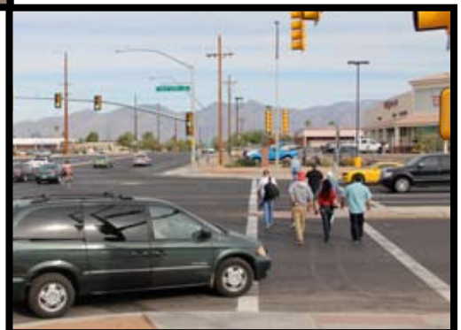
Golf Links and Kolb intersection improvement

The improved intersection of Golf Link and Kolb roads was dedicated on Oct. 29. Improvements included widening the existing intersection to provide dual left turn lanes in all directions, new six-foot wide sidewalks,