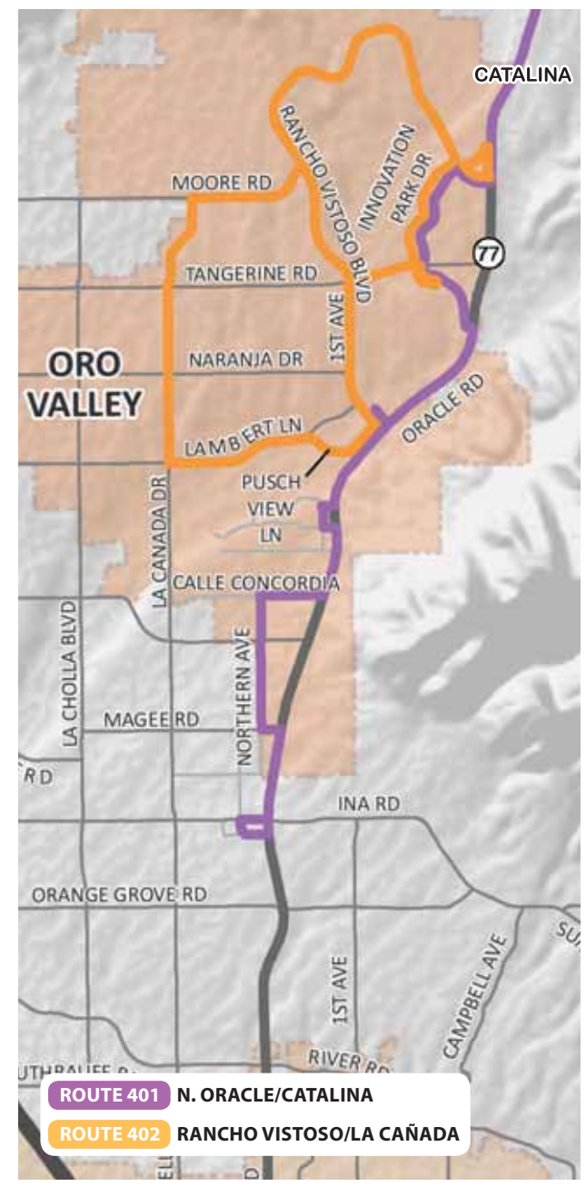
ROUTE 401 N. ORACLE/CATALINA ROUTE 402 RANCHO VISTOSO/LA CAÑADA