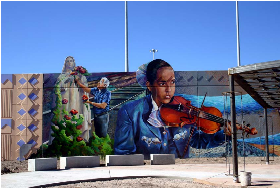
Barrio Anita murals