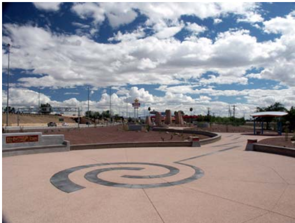
Interstate 10 Gateway

First established by the Intermodal Surface Transportation Efficiency Act (ISTEA) in 1991 and continued in subsequent reauthorization bills, Transportation Enhancement (TE) activities are federally funded, community-based projects that expand travel choices and enhance the transportation experience by improving the cultural, historic, aesthetic and environmental aspects of our transportation infrastructure.