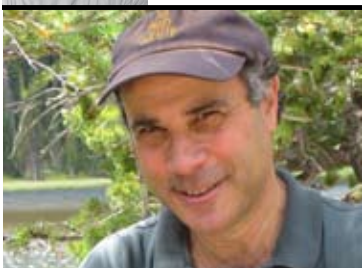
Dr. Robert Zubrin President, Pioneer Astronautics and the Mars Society. Author, "Energy Victory"