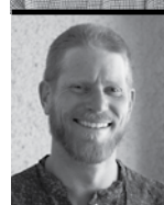
Brad Lancaster Author, "Rainwater Harvesting for Drylands, Volumes 1 & 2," and website HarvestingRainwater.com