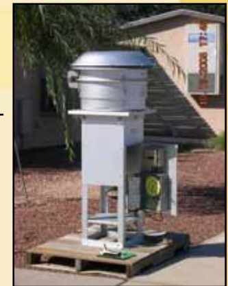
SUSD Transportation Dept.